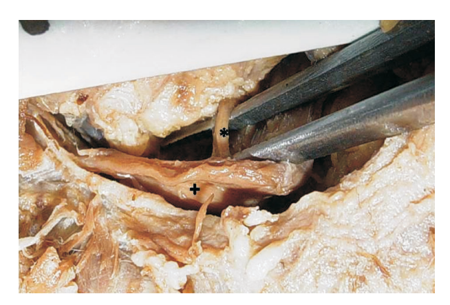
Fig. 2 Photograph taken at the front of the face showing the oculomotor nerve (*) entering the inferior oblique muscle (+) through its ocular surface.