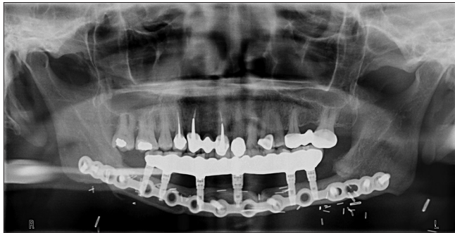
Figure 3: Full mandibular reconstruction using fibula osteoseptocutaneous flaps, dental implants, and fixed dental prostheses (Case No. 1).