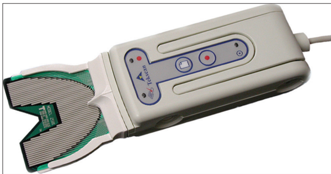
Figure 1: T-scan III system.

The T-scan III system recorded the changes in occlusal contact at a time interval of 0.01 s producing dynamic