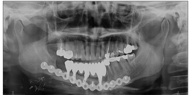
Figure 4: Mandibular reconstruction area larger than half of the arch (Case No. 5).