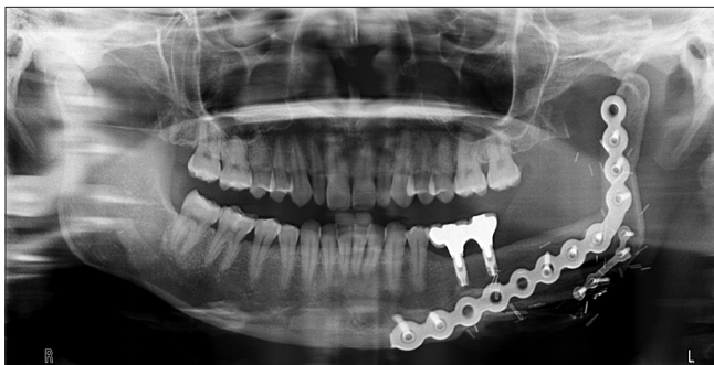
Figure 5: Mandibular reconstruction area less than half of the arch (Case No. 9).

Results of the maximum occlusal force, occlusal time, anterior–posterior and left–right asymmetrical distribution of occlusal force, and anterior–posterior and left–right locations of asymmetrical occlusal centers are presented in Table 2. The maximum occlusal force of each group was 1669.95 g/cm 2 , 1322.17 g/cm 2 , and 2563.67 g/cm 2 , respectively. The average time to finish one occlusion to the ICP of each group was 2.94 s, 1.93 s, and 2.25 s, respectively. The left–right asymmetries in occlusal force were 28.39%,